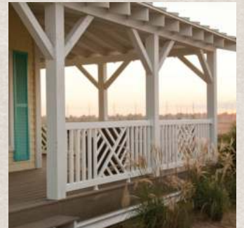
Ply Gem Fence and Railing