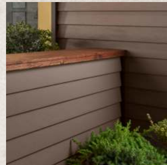
Ply Gem Steel Siding