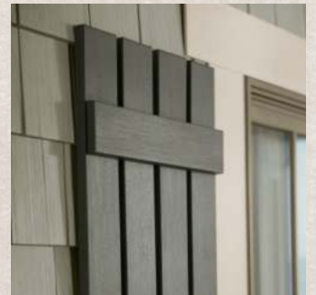
Ply Gem Shutters and Accents