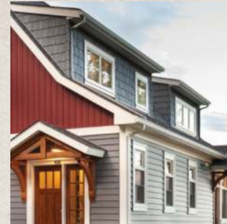
Vinyl Siding and Accent Panels

*Consult the VSI Website at vinylsiding.org for current list of certified products and colors.