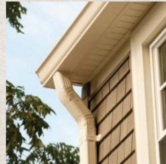
Rainware, Fascia, Soffit